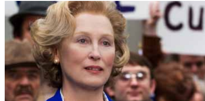
THE IRON LADY