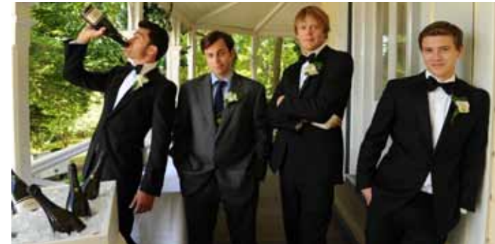
A FEW BEST MEN

WEEKLY FILM PROGRAM Thur 26 Jan- Wed 1 Feb